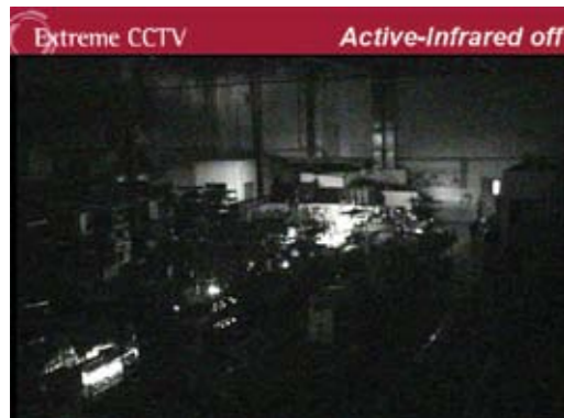
An image showing how typical cameras react to uneven lighting conditions. The background underexposed and the foreground overexposed. On the right Black Diamond technology produces High Fidelity illumination and normalizes the scene producing a photonically balanced image.