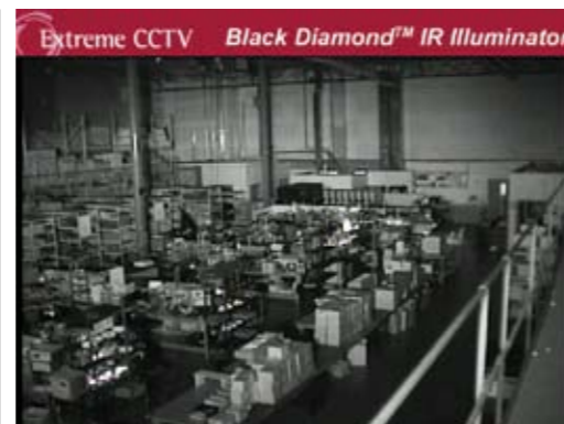
any one time. Most cameras cannot respond effectively at 2 ranges simultaneously. The most common manifestation of this principle is a point source of light (at Point A, for example) in a dark scene (B). In such a scene, the resulting image shows A as a very bright hotspot while dark areas at B become even darker.

Images such as the one described above generally show both overexposure (bright areas too bright) and underexposure (dark areas too dark). In general, the more varying the light conditions in a scene, the more difficult it is for a CCD to adapt. Most CCDs respond by using an average exposure somewhere in between the dark and light areas. Unfortunately the